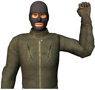
Breacher Fist held in the air