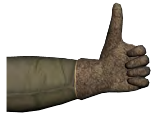
Friendly Thumbs up