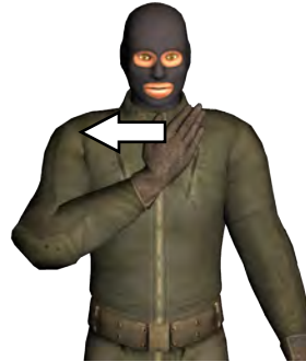
Man Down Draw hand across throat