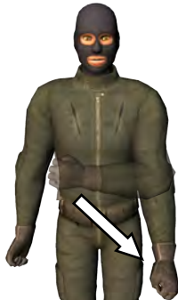
Door Open Arm begins across chest then moves down to waist