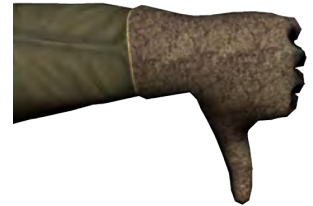
Hostile Thumbs down