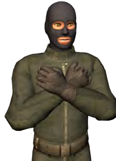
Obstruction Arms folded across chest