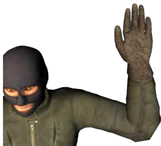
Stop Palm held up. Stop immediately