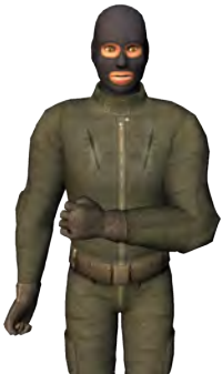
Door Closed Arm across chest with clenched fist