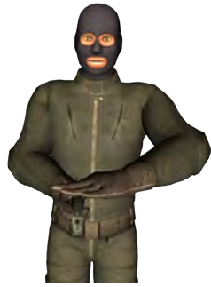
Cover Needed Support hand over weapon