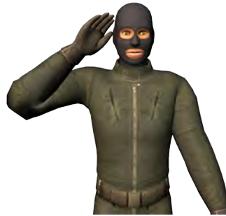
Listen Cup hand behind ear