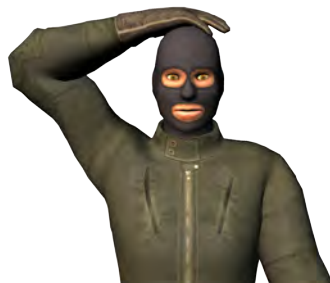
To Me Palm placed on top of head