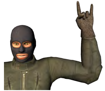
Dog needed Inside fingers folded