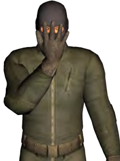
Mirror Needed Hand held in front of of face